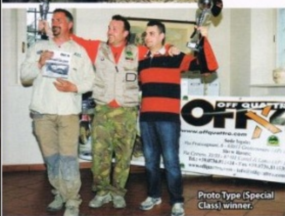
Proto Type (Special Class) winner.