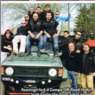
Ramingo 4x4-4 Zampe Off-Road (Italy) took home the Team Spirit award.

as they tackled the more difficult and technical SS of the event.