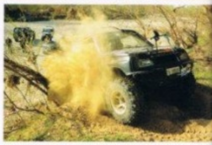
Dashing through the SS along the banks of the Isonzo River.

The second and final days proved to be very taxing on both man and machine